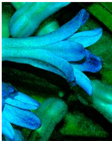
Hyacinth Cluster Archival Digital Pigment Print 14" x 11"

W ith just a camera, digital software, garden and green thumb, Debra Kayata cultivates unique and surprisingly foreign views of nature. The New Jersey-based graduate of New York's School of Visual Arts manipulates unconventional, almost abstract digital close-ups of flowers and gardens that she grows, altering textures and tonalities to offer beautifully intimate portraits of bewitching blossoms. That distinction between human intervention and organic cycles of growth and decay, lies at the root of Kayata's work. "This series," she writes, "seeks to concentrate on the idea of beauty and its artificial preservation."