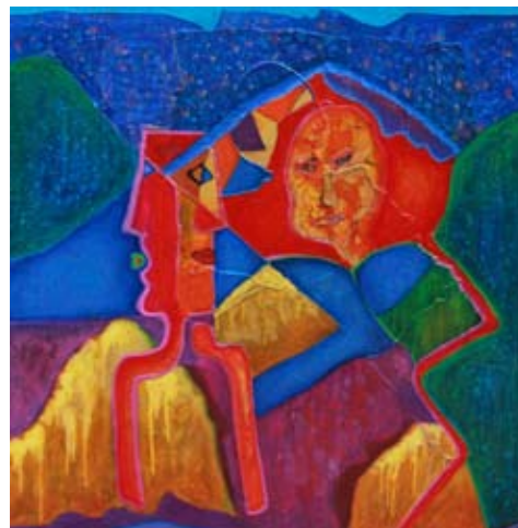
Mountains of Angels Oil with Mixed Media on Canvas 44" x 44"